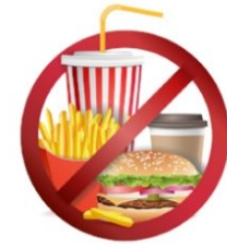
No Food Deliveries