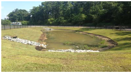
North Myrtle Beach Elementary