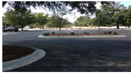
South Conway Elementary