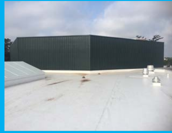
Metal Wall Panels Around Auditorium