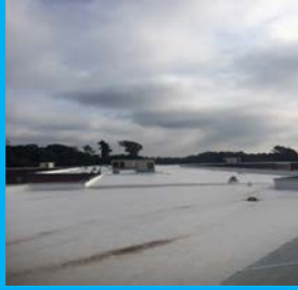
Completed TPO Membrane