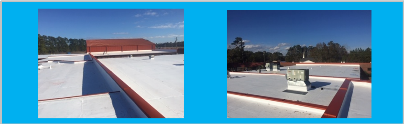
New TPO and Flashings